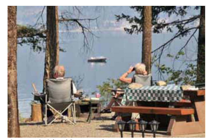
Fintry Provincial Park& Protected Area