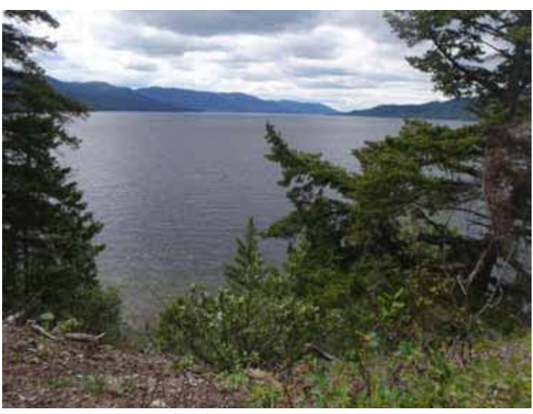
Francois Lake Provincial Park