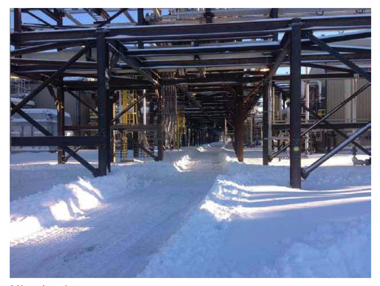
Cabin gas plant project

The Environmental Assessment Office evaluates proposed projects that are reviewable under the <u>Environmental Assessment Act</u> for potential adverse environmental, economic, social, heritage and health effects and verifies and enforces compliance with the conditions of environmental assessment certificates.