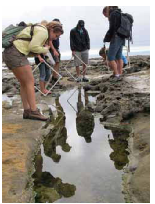
Botanical Beach Provincial Park

Events such as spills and catastrophic fires can present risks to public health and safety, property and the environment. Although not all environmental risks are avoidable, effective management can help to minimize and offset the impact of these risks. The Ministry anticipates, responds to and manages the consequences of risks to the environment, as well as risks to public safety involving human wildlife conflict.