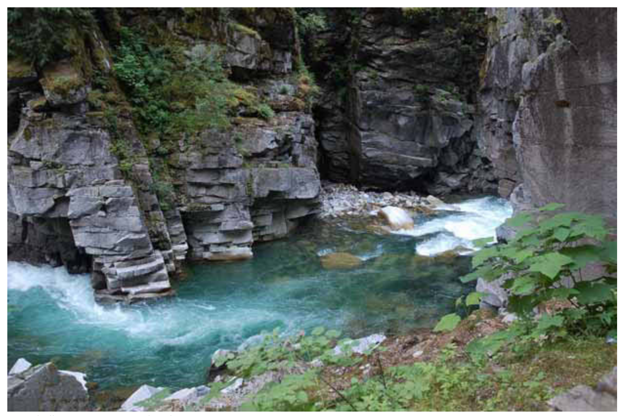
Coquihalla Canyon Provincial Park

Under the direction of the Natural Resource Board, natural resource ministries have adopted a sector approach which promotes streamlined authorization processes and enhanced access to public services across the province. This facilitates more consistent engagement and consultation with industry, stakeholders, partners and clients. It also enhances inclusion of First Nation, economic and environmental considerations into decision making. The ministries are working together to make these improvements and meet the commitments of the BC Jobs Plan .