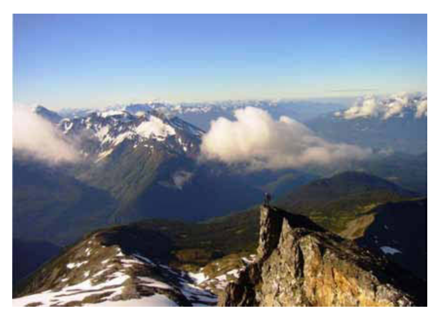
Seven Sisters Provincial Park & Protected Area

GHG emissions decreased from 63.3 megatonnes in 2010 to 62.2 megatonnes in 2011, a change of 1.7 per cent. From 2010 to 2011, emissions decreased due to a decrease in electricity and heat generation and fossil fuel production and refining energy use, and decreased emissions from off-road diesel vehicles. Increases in emissions were seen in coal mine and oil and natural gas fugitive emissions, residential, commercial and institutional buildings, and