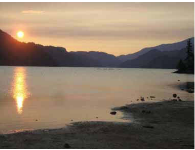
Simpson Lake East Conservancy

British Columbia's real GDP increased by 2.0 per cent in 2013 (according to preliminary GDP by industry data from Statistics Canada), following growth of 1.5 per cent in 2012. Annual gains were observed in consumer spending, manufacturing shipments and exports, while modest declines occurred in employment and housing starts. Several risks to British Columbia's economy remain, including slowing domestic activity, weakness in the US economic recovery, the ongoing sovereign debt situation in Europe, slowing Asian demand and exchange rate volatility.