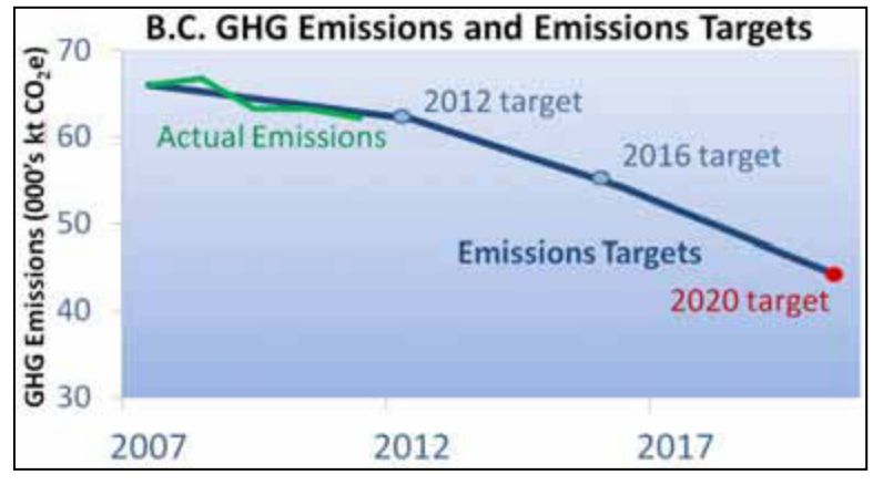
Figure 1 - B.C. GHG Emissions and Emissions Targets

The data for the performance measure are taken from Environment Canada's National Inventory Report , which is prepared to meet Canada's obligations under the <u>United Nations Framework Convention on Climate Change</u>. The report is published annually with an