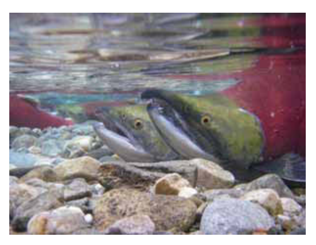
A pair of sockeye salmon (oncorhynchus nerka)