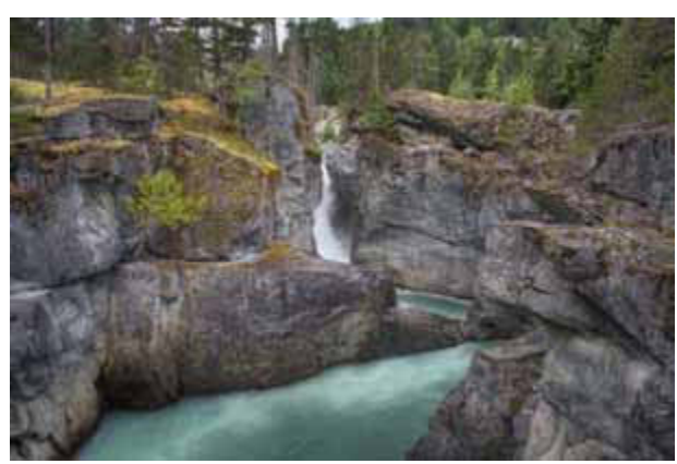
Nairn Falls Provincial Park

All members of the B.C. Executive Council were provided <u>letters from the Premier</u> outlining their key responsibilities as part of their mandates. For the Ministry of Environment, this includes continuing B.C.'s leadership on climate action and supporting the Province's opportunity to develop the liquefied natural gas sector. Progress made on the Minster's mandate letter objectives includes: