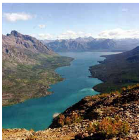
Ts'il?os Provincial Park

Climate change has global, regional and local significance. Changes in climate drive changes in natural systems that affect economic, environmental and social interests. The current rapid rate of change is of serious concern and is linked to the burning of fossil fuels and other human activities that release greenhouse gases into the atmosphere. Population growth is also contributing to the impact. How we respond to climate change will shape our economy, the environment, our society, our communities and our way of life.