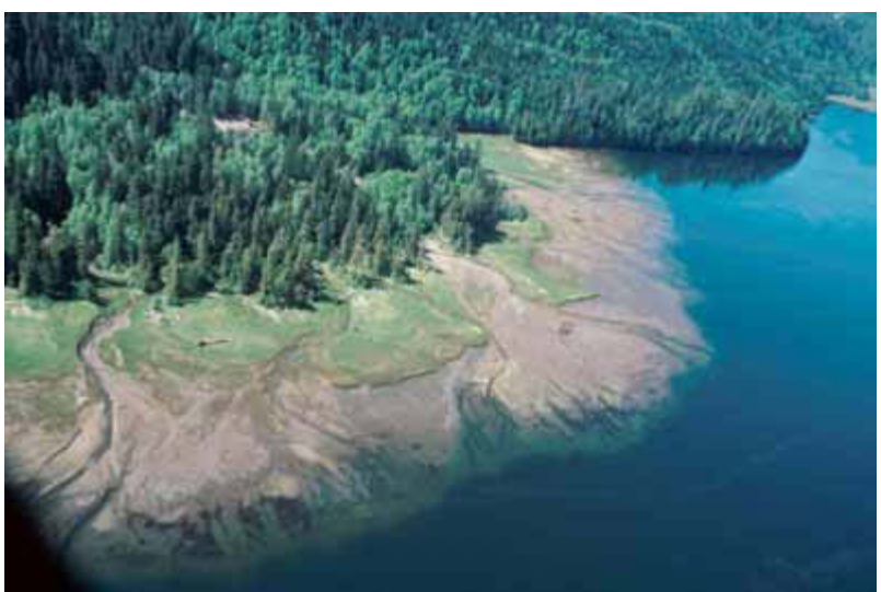
Khutzeymateen Provincial Park 2013/14 Annual Service Plan Report

A safe and sustainable supply of high-quality water is vital to our communities, economy and environment. This can be achieved through effective legislation, innovative approaches to