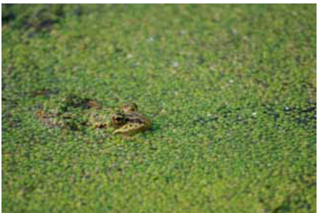
Purden Lake Provincial Park

internationally recognized methods and science-based criteria and factors such as rarity, trends in populations or habitat, and threats.