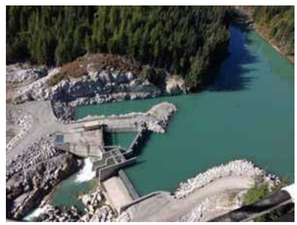
Upper Harrison Hydroelectric Project – Intake and headpond.

By posting the compliance self-reports, the Environmental Assessment Office ensures transparency and accountability to the public. Making this information publicly available also assists with compliance promotion and helps industry develop similar projects in a responsible manner.