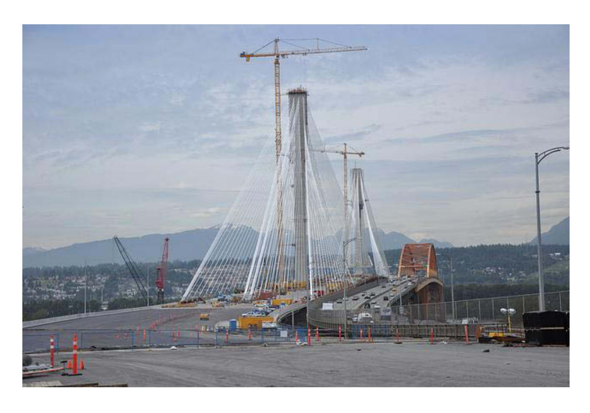
A major milestone for the Port Mann Bridge/Highway 1 Improvement Project occurred in the summer of 2012 with the closure of the centre gap on the new bridge. This marked the completion of the bridge deck and superstructure.

Objective: The Port Mann/Highway 1 Improvement Project is the largest transportation infrastructure project in B.C. history. It includes the construction of a new 10-lane Port Mann Bridge, the widest bridge in the world, and 37 kilometres of highway widening and interchange improvements from Vancouver to Langley. Phase One of the project reached completion in December 2012 when the new bridge opened to eight lanes of traffic and improvements east of the bridge achieved major completion. Since December, drivers traveling between Langley and Vancouver are seeing time savings of up to 30 minutes per day. When complete, the project will reduce travel times by up to 50 per cent and save drivers up to an hour a day. Transportation Investment Corporation (TI Corp) is the provincial Crown corporation delivering the project. TI Corp prepares its own service plan and annual report, separate from the Ministry's, which can be found at: www.pmh1project.com.