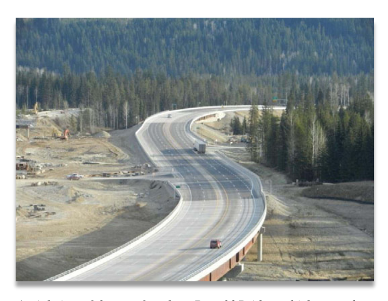
Aerial view of the new four-lane Donald Bridge, which opened to traffic in November 2012.

Cariboo Connector Program – The second phase of the Cariboo Connector Program was announced last fiscal with $200 million to be invested over five years for seven new projects. One project has been completed (Bonaparte Intersection) and three projects are under construction;