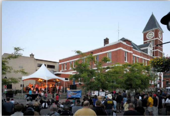
Duncan's City Square, with its picturesque backdrop of City Hall, is the centre of many festivals and cultural events throughout the year.