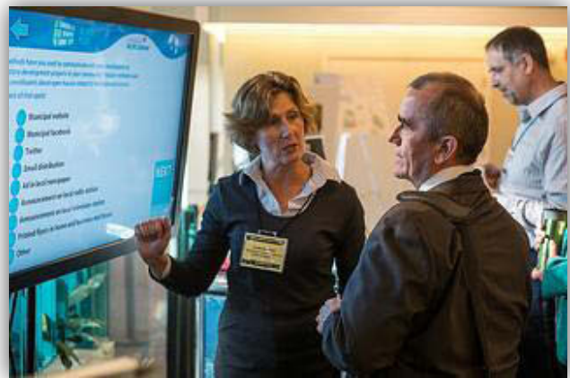
The Ministry plays a large role in coordinating the B.C. government's participation in the Union of British Columbia Municipalities' annual convention, which hosts elected officials from across the province.