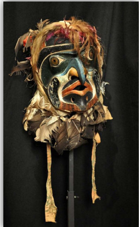
The U'mista Cultural Centre received funding from the BC Creative Spaces program to help protect their invaluable collection of sacred regalia.