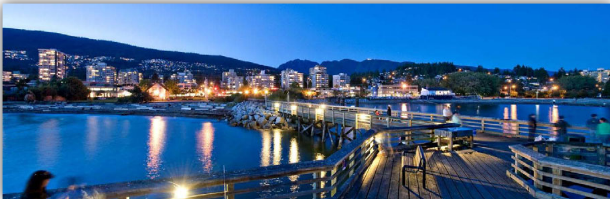
The stunning view from Ambleside Pier in West Vancouver.