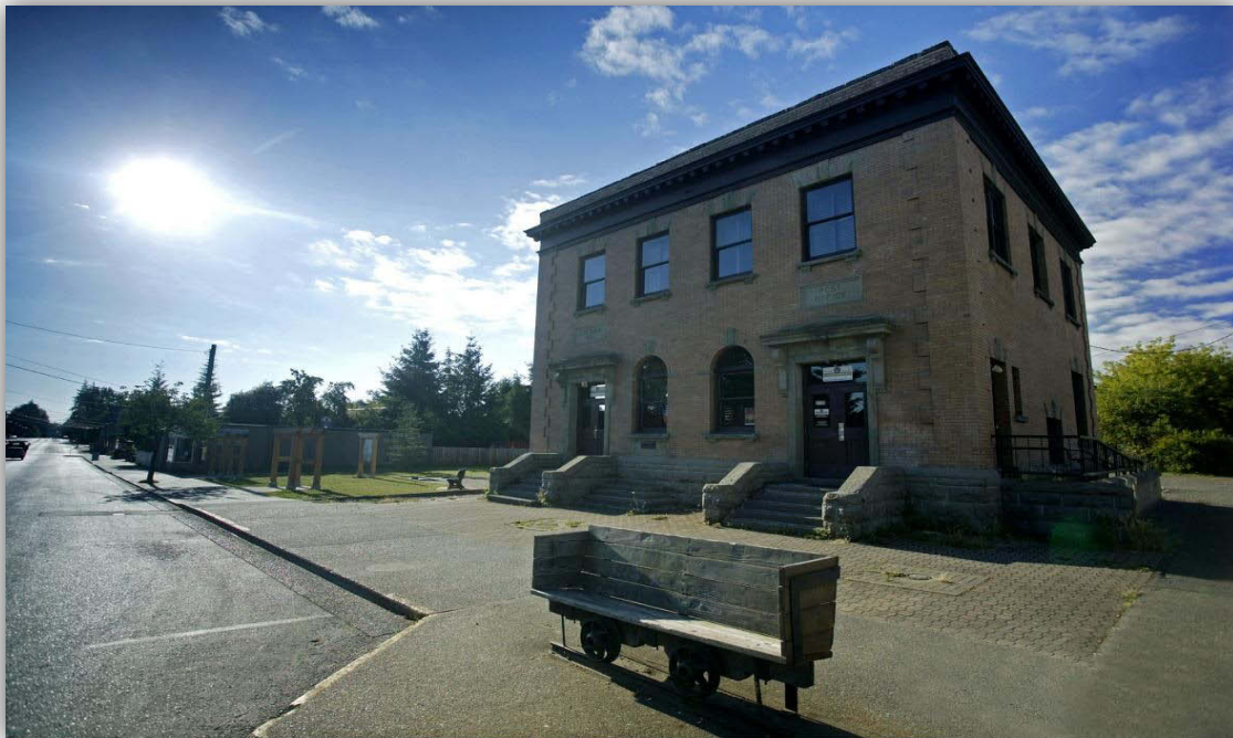
Partnering with the Rotary Club of Cumberland Centennial, the B.C. government provided funding through a Community Gaming Grant to support the redevelopment of Cumberland Village Park's playground.

Community gaming grants invest in B.C.'s not-for-profit organizations that provide vital services to British Columbia's communities. In 2012/13 over 5,200 organizations throughout the province received $135 million in gaming grant funds to aid in the delivery of community programs and services.