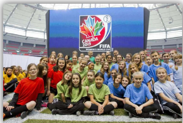
Ministry support of the 2015 FIFA Women's World Cup will bring economic benefits to B.C. and showcase Canada's finest athletes, inspiring the next generation of soccer players