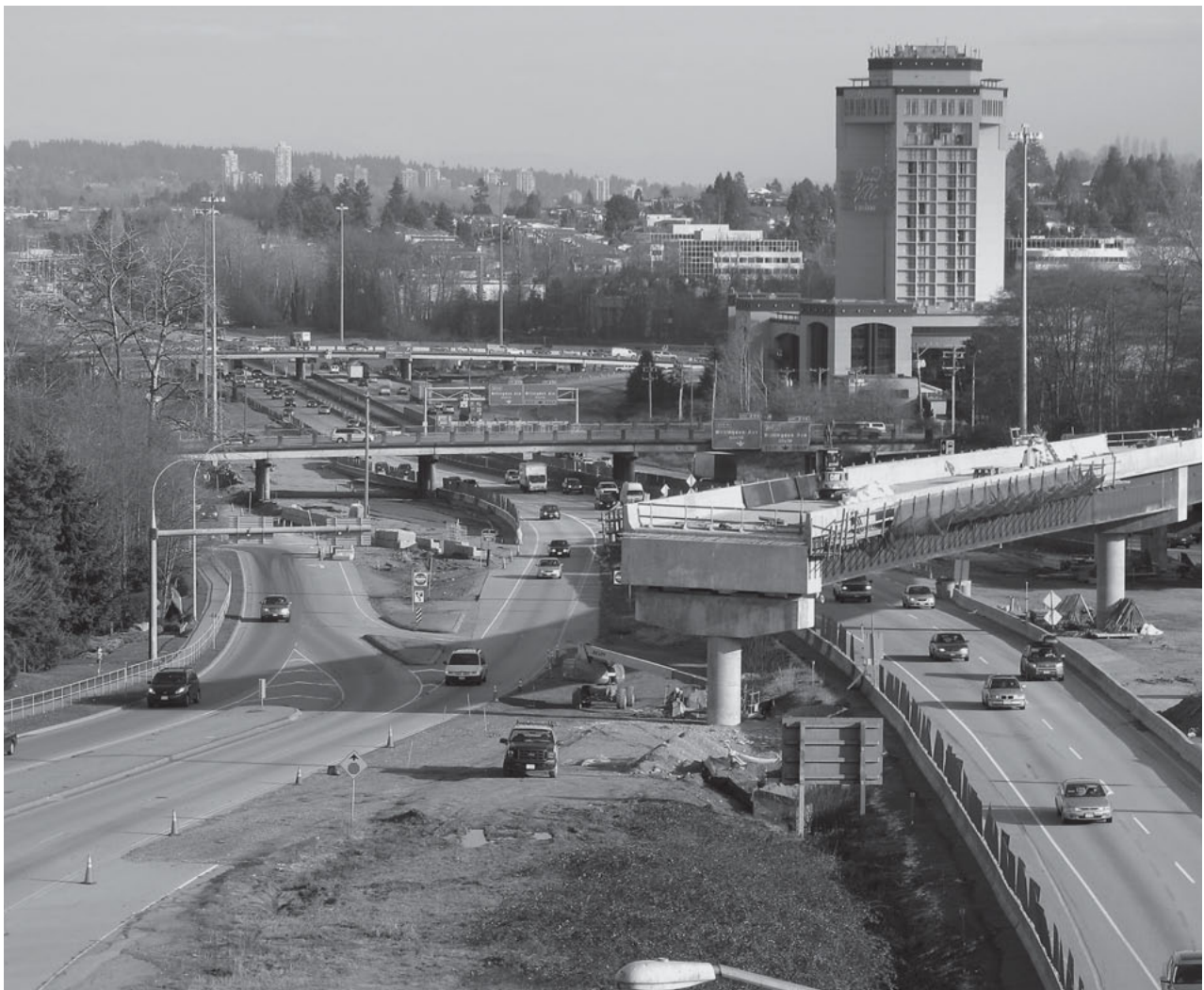
Port Mann Highway Improvement Project – Grandview Highway exit ramp

As the partnership program has matured and more projects have entered the construction and operations phase, Partnerships BC is well-positioned to provide support based on its knowledge of how project agreements are structured, and the allocation of roles and responsibilities between the public and private sector partners. There was concerted effort to review projects in the operations stage to gather real-time feedback and lessons to be applied to subsequent projects.