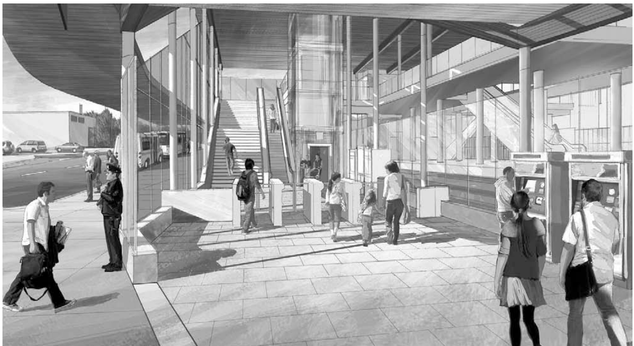
Artist rendering of Evergreen Line stations in Coquitlam (top) and Port Moody (bottom).