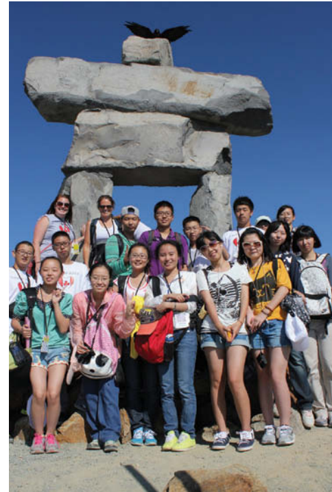
BCCIE embraces internationalization and the promotion of global understanding.

We are committed to meeting and maintaining the highest standard of integrity expected by our stakeholders, government, and all British Columbians. We promote and follow fair and transparent policies and processes in all that we do.