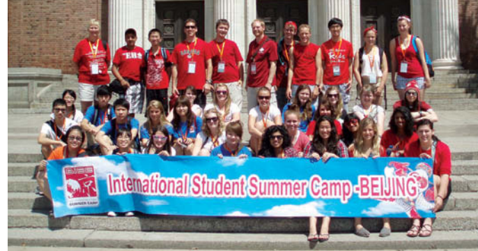
Represented by 20,000 students, China is the largest single source country for international students in BC.

BCCIE supported several of government's international activities during 2012/13. For BC's larger trade missions, we planned and led the mission's education component, engaging our networks and deploying our deep sectoral knowledge to support government goals. We again supported a Hanban-sponsored tour of China by a large group of K-12 superintendents and colleagues. We delivered a major Team BC marketing mission to China on behalf of the Province.