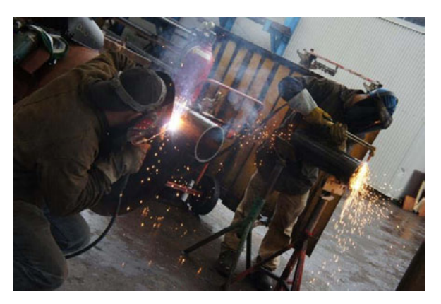
Students in welding programs at the British Columbia Institute of Technology