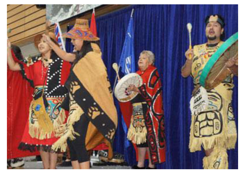
The Git Hayetsk Dancers - "a people of the copper shield" perform at the opening of the Aboriginal Gathering Place at the British Columbia Institute of Technology.

In future Service Plan Reports, the Ministry will report on the number of credentials awarded to Aboriginal students. In 2010/11, over 2,600 credentials were awarded to Aboriginal students enrolled at B.C.'s public post-secondary institutions.