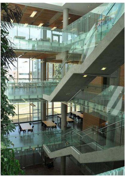
House of Learning at Thompson Rivers University

The Ministry strives to ensure that post-secondary education is affordable for students and their families. Since September 2005, government has limited tuition fee increases at public post-secondary institutions to 2% per year, leading to B.C. having the fourth lowest undergraduate tuition in Canada. Government also provides financial support to students who are in need. In 2011/12, the Province provided financial assistance to over 66,000 students, who received over $772 million in student financial aid. This included over $42 million in reduced or forgiven loans to students who succeeded in completing their education.