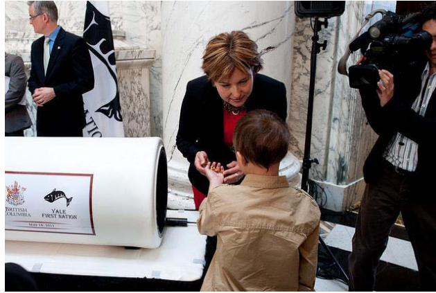
Premier Christy Clark assists a child with placing an item into the time capsule, which was a gift to the Yale First Nation at the signing of the treaty.

While challenges exist, innovative approaches, sound planning and vibrant partnerships with First Nations and Aboriginal organizations have made it possible for the ministry to maintain the dynamic energy that has moved parties closer to mutual goals in the last few years. As the number of agreements between British Columbia and First Nations grows, the ministry will target additional resources on agreement implementation.