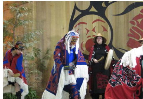
Ceremony at the Gathering Our Voices conference in Prince Rupert

In 2010/11, the ministry worked with Aboriginal communities on a number of initiatives that develop capacity and governance capabilities in First Nation communities. Among these initiatives are working with youth in Ehattesaht and Tseycum and building capacity in leadership and strategic planning in First Nations communities. The ministry also assisted communities in building relationships and networks to access funding to support their priorities.