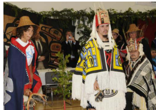
Haida Gwaii renaming ceremony

The ministry continues to work at increasing positive public awareness and to honour the valuable contributions of Aboriginal peoples to British Columbia. For example, May 27, 2010 was proclaimed as Four Host First Nations Day in recognition of the achievements of the four First Nations who hosted the Vancouver 2010 Winter Olympics. Furthermore, six individuals were honoured as recipients of the 2010 B.C. Creative Achievement Awards for First Nations Art. The naming of the Salish Sea and the renaming of Haida Gwaii are additional examples of how the ministry is working to honour the contributions of First Nations in British Columbia.