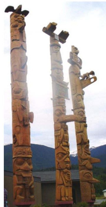
Nisga'a totem poles in New Aiyansh

The ministry supported a completed impact benefit agreement between Nisga'a and BC Hydro that provided employment, contracting and other financial opportunities to the Nisga'a. The agreement provides Nisga'a support for the construction and operation of the Northwest Transmission Line and was ratified in the Nisga'a legislature.