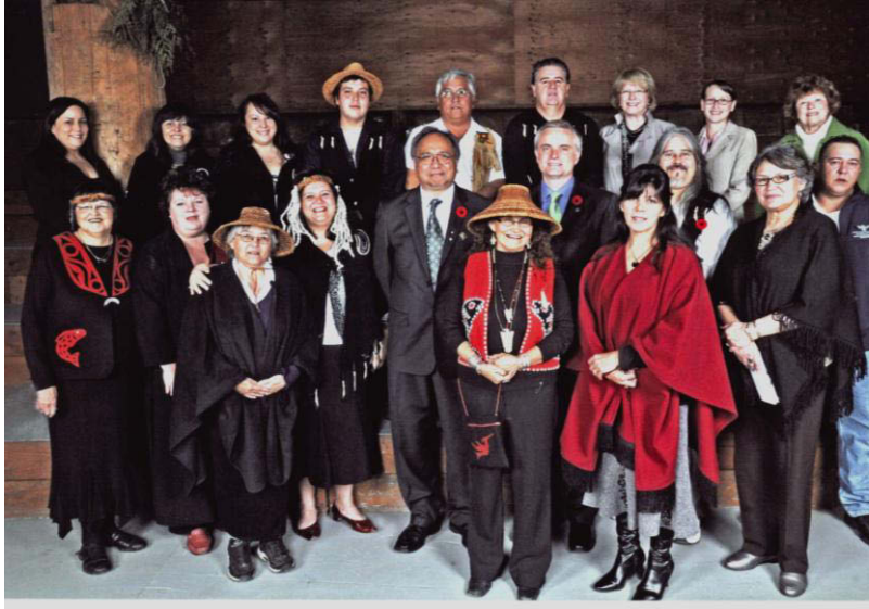
Former Aboriginal Relations and Reconciliation Minister Barry Penner at the opening of the Tsawwassen Legislature in November 2010.

Tsawwassen treaty implementation: Since signing the Tsawwassen Final Agreement in 2009, the ministry has worked with Tsawwassen First Nation to access Canada's Economic Action Plan and construct the first phase of the Tsawwassen Industrial Lands, a ground-breaking $9 million project. The ministry also worked with Tsawwassen First Nation and the Corporation of Delta to finalize and give effect to a set of servicing agreements to facilitate the transition to self-