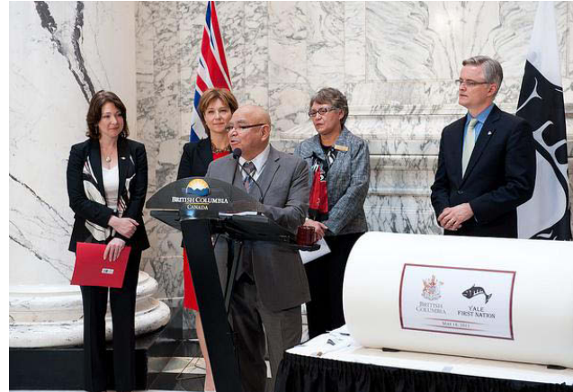
Celebrating the introduction of the Yale treaty legislation.