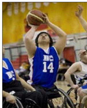
Team BC at the 2007 Canada Winter Games.

Working with partners in and outside of government, the Ministry supports a “Canadian Sport for Life” model of sport and recreation program delivery. This playground-to-podium approach promotes opportunities for British Columbians of all ages, aspirations and abilities to benefit from sport and an active lifestyle. The Ministry supports the