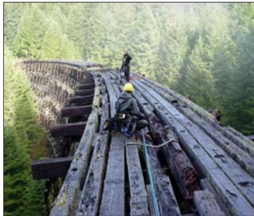
Historic Kinsol Trestle, Cowichan Valley.

The strong B.C. economy is fuelling development pressure on more than 30,000 archaeological sites. The Ministry promotes archaeological site protection in cooperation with First Nations, local governments, land use agencies and resource industries, linking conservation to development oversight to achieve the widest awareness of this fragile resource.