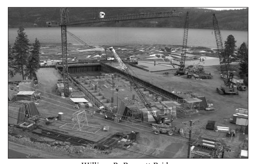
William R. Bennett Bridge Installation of Top Slab Formwork.

Costs: The bridge and east approach capital improvements are estimated to cost $144.5 million.