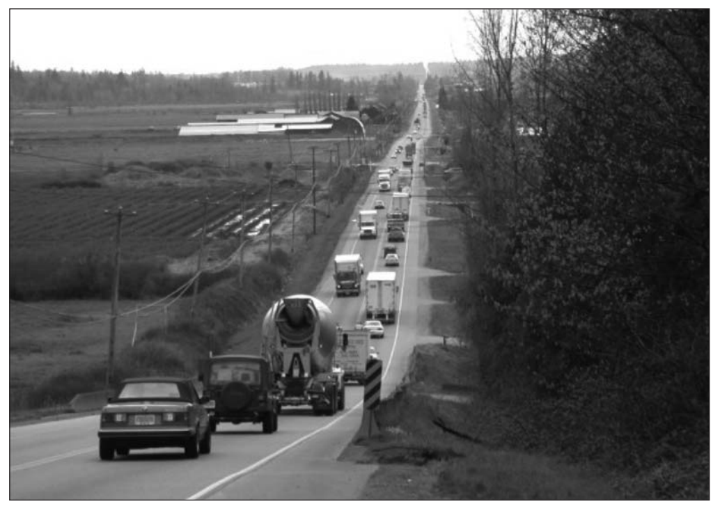
Congestion on Highway 15 — Addressed by Border Infrastructure Project

The performance measures in the following table are grouped by the goals and objectives they serve.