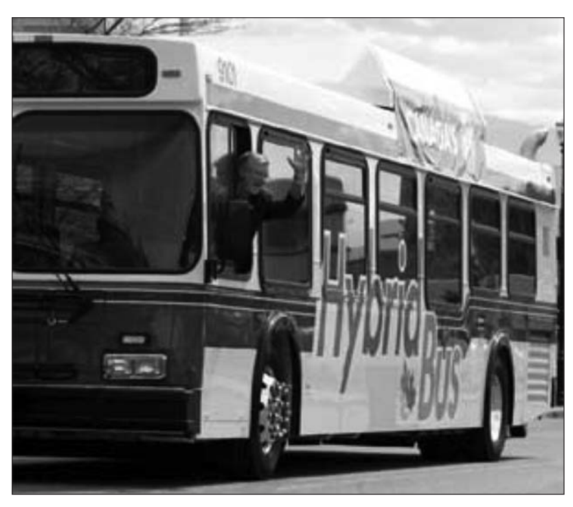
Kelowna New Hybrid Electric Bus

Minimal resources are dedicated to administering key transportation regulations. The ministry anticipates no major changes in its available resources or the way they are invested.