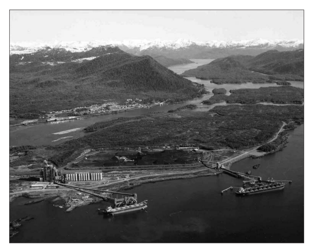
Prince Rupert Port Facilities — Loading Grain and Coal for Export

Whenever ministry employees develop new policies, design new projects or review past accomplishments, these values are the benchmark for success.