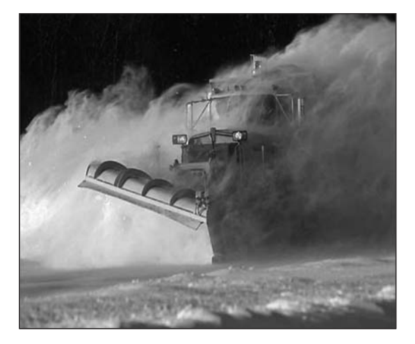
Winter Highway Maintenance

The ministry's highway operations are divided into three regions: South Coast, Southern Interior and Northern. Each region is subdivided into districts and maintenance areas for more efficient administration. Highway maintenance is carried out by maintenance contractors in 28 areas across the province. Ministry employees manage and work closely with the maintenance contractors to ensure they meet ministry standards. Timely rehabilitation prevents more costly repairs. Highway Operations determines where investment would do the most good, resurfaces roads and bridges, replaces bridges at the end of their service lives, and performs other work to extend the life of the transportation network.