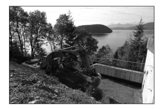
STS Hwy — Building Retaining Wall

Canadian Consulting Engineering award for excellence, and the Consulting Engineers of B.C. award for merit.