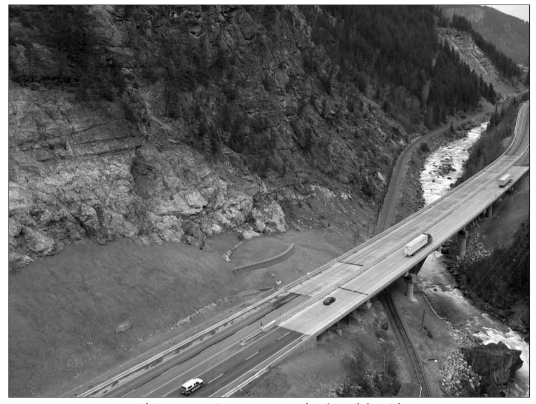
Kicking Horse Canyon New Yoho (5-Mile) Bridge