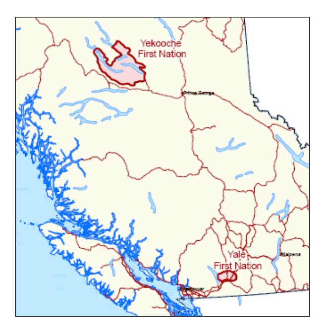
Map outlining traditional territories for Yale and Yekooche First Nations. Both First Nations are currently involved in the British Columbia Treaty Process. During the fiscal year of 2005/06, Yale and Yekooche First Nations both signed Agreements-in-Principle with British Columbia and Canada.

• British Columbia and Canada signed Agreements-in-Principle with the Yale First Nation and the Yekooche First Nation. Approval of these Agreements-in-Principle indicates that these treaty tables are making real progress towards Final Agreements.