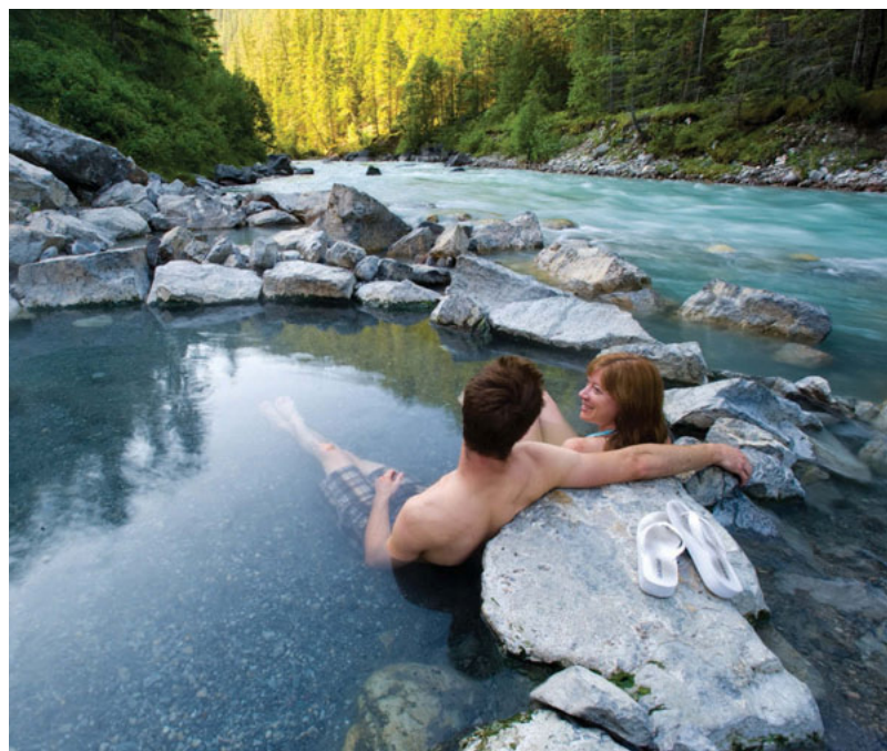
Lussier Hot Springs