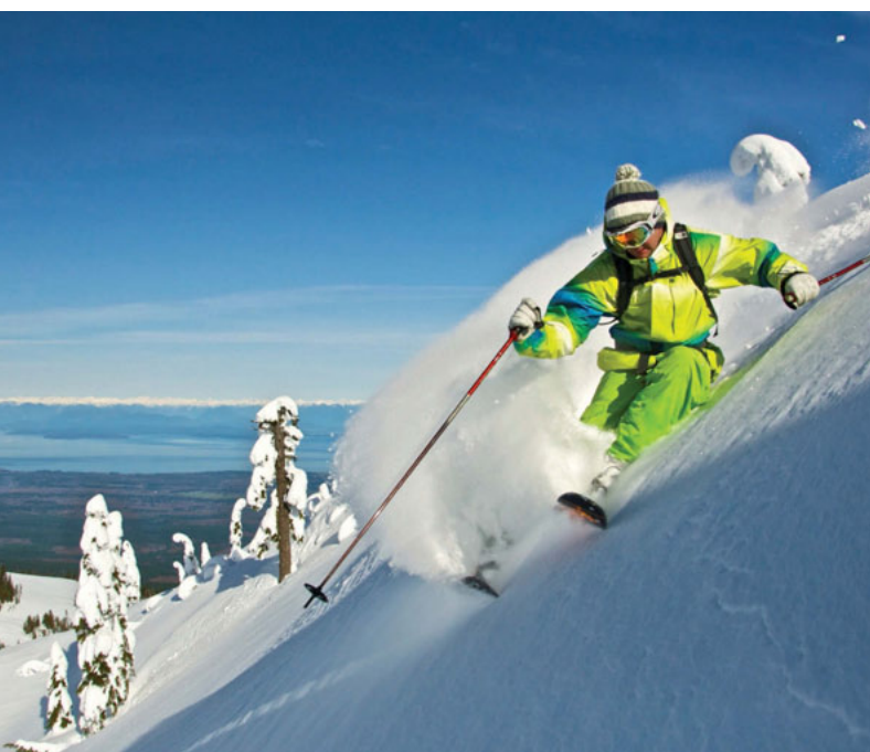
Mount Washington Alpine Resort

Data Source: Destination BC and third party independent research firm.