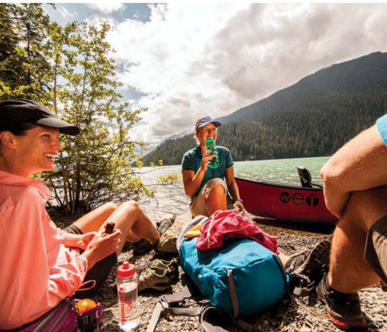
Garibaldi Provincial Park