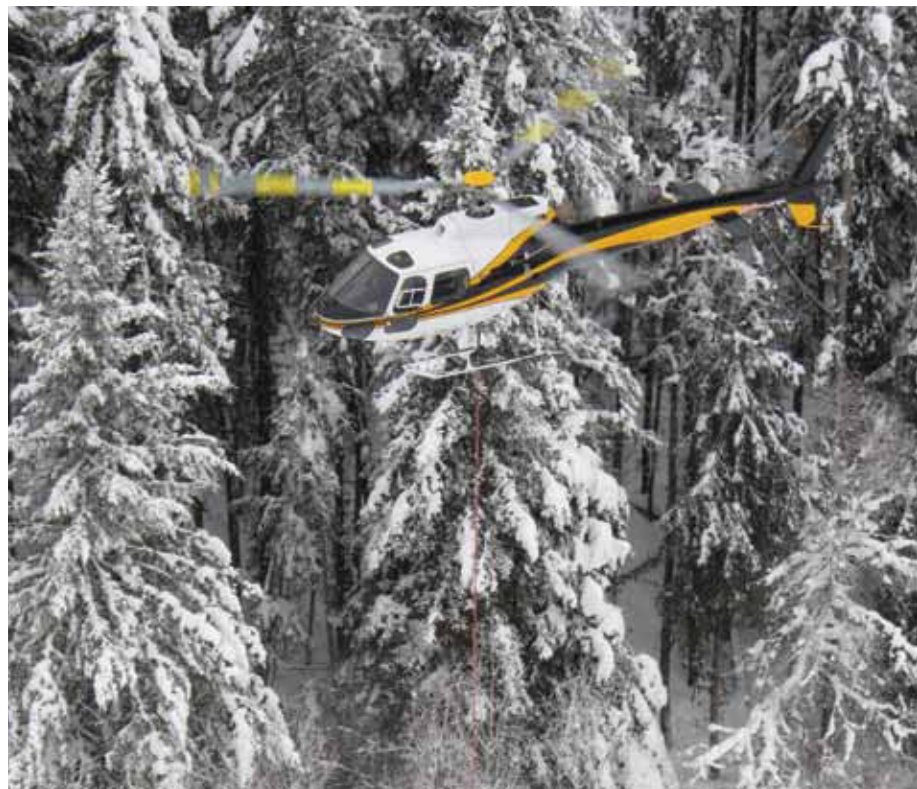
CBT helped Valemount's Yellowhead Helicopters purchase five new helicopters to expand its business.