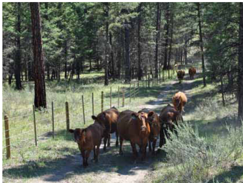
The Grassland and Rangeland Enhancement Fund focuses on helping improve Crown range.