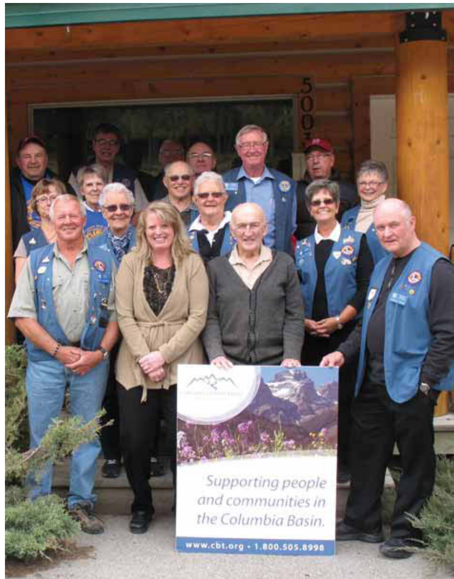
CBT funds helped the Fairmont Lions Club open the Lions Den, a multipurpose meeting place for groups of all kinds.

As mentioned elsewhere in this plan, CBT's revenues are expected to grow over the next few years which could place additional demands on the organization. CBT has initiated consultations with Basin residents around these increased revenues.