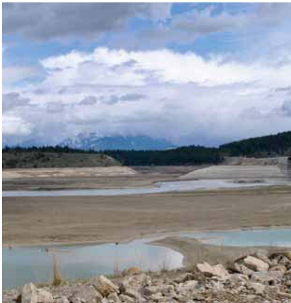
The East Kootenay-Koocanusa Fish and Wildlife Program is helping protect and enhance fish, wildlife and habitats.