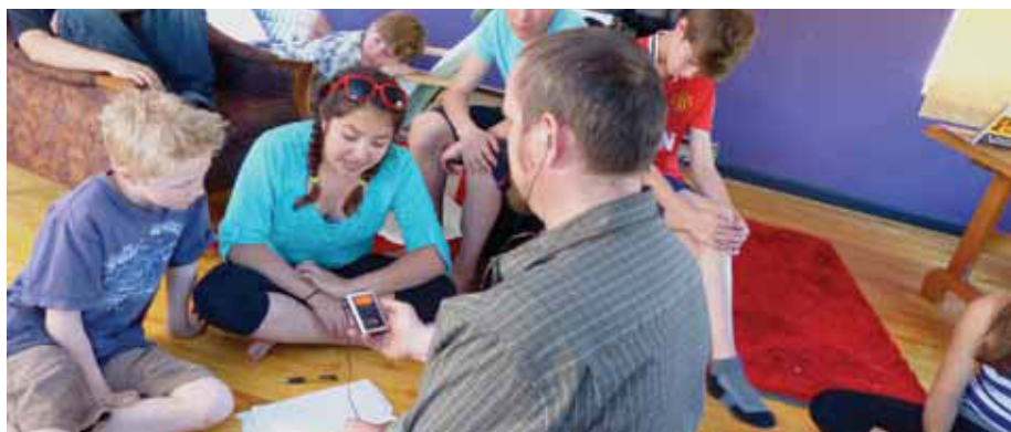
The Ymir Community Youth Initiative is one of the projects that received funding through CBT's Youth Grants Program.