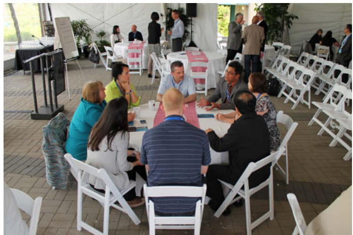
Summer Seminar, BCCIE's annual professional development conference, brings together over 250 participants from our province and around the world.

Each year BCCIE coordinates the following activities: at least ten professional development and speaker series events, two to three international missions, two to three signature conference events, six incoming delegations and two incoming familiarization tours for educators and students from abroad. In addition, BCCIE sends out an average of 24 bulletins and newsletters, processes over 100 new and renewal Education Quality Assurance (EQA) applications, and maintains its three websites (BCCIE primary, EQA and StudyinBC).