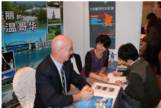
BC schools, school districts and institutions participated in the China Education Expo 2013 in Chengdu