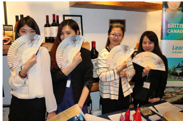
BC/Shanghai Alumni Evening in Jing'an District, Shanghai