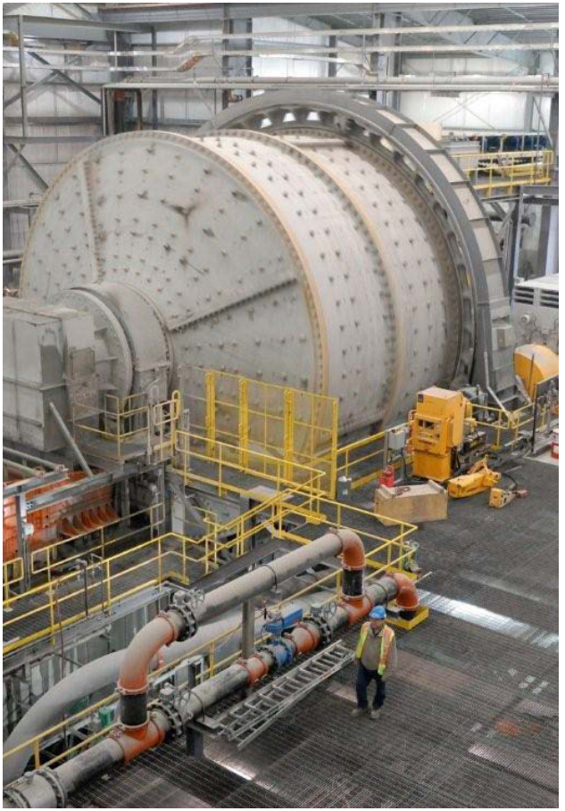
Ball mill at the Copper Mountain Mine near Princeton, B.C. Opened on August 18, 2011, this mine employs 270 people.

Annual mineral exploration investment includes expenditures on prospecting, geological surveys, mapping, mineral valuation, drilling and rock work. Annual investment in mines includes mine planning, permitting, environmental assessment, construction, operation and reclamation.