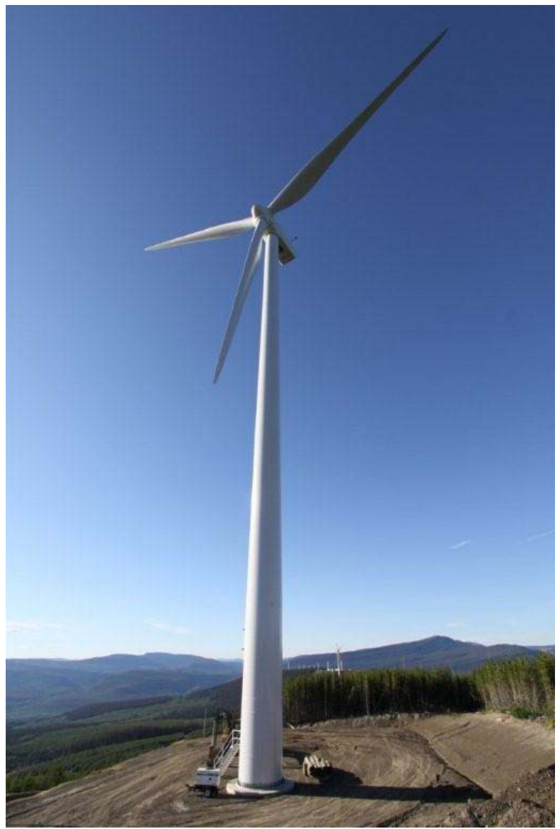
Dokie Ridge wind-powered electricity generating turbine located near Chetwynd, British Columbia.

The Ministry is responsible for administering all or parts of 42 statutes pertaining to the energy, mining, gaming, liquor distribution and housing sectors, and has policy responsibilities under the Utilities Commission Act . The Ministry is responsible for the following five Crown Corporations: the British Columbia Hydro and Power Authority (BC Hydro), the Columbia Power Corporation, the Oil and Gas Commission, the British Columbia Housing Management Commission (BC Housing), and the British Columbia Lottery Corporation. The Ministry also has responsibility for the Liquor Distribution Branch.