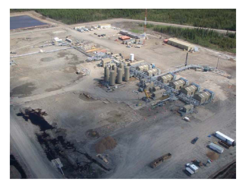
A multi-well pad site used for shale gas production in Northeast B.C.