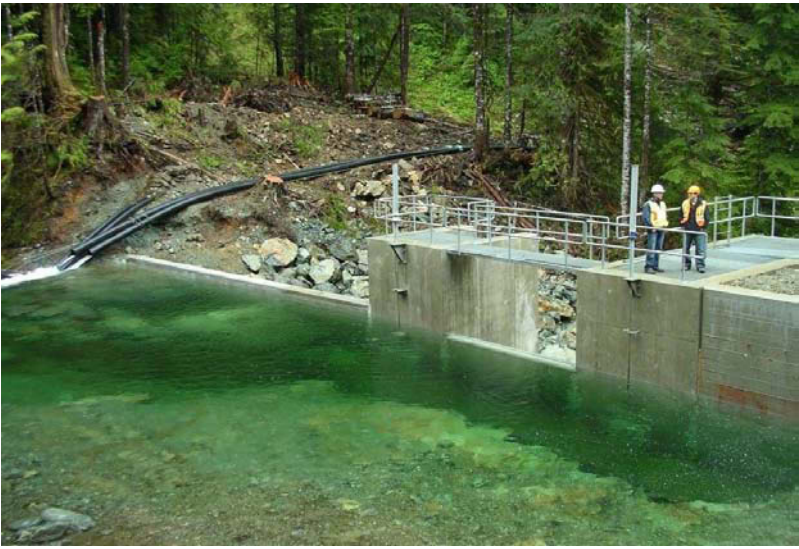
Canoe Creek Hydro on the Tla-o-qui-aht First Nation's traditional territory on Vancouver Island is a run-of-the-river hydropower project that generates clean electricity.