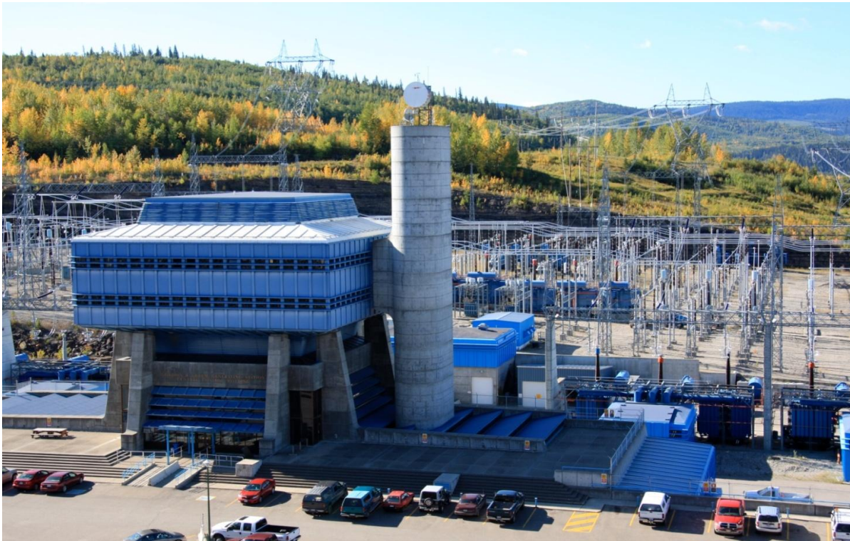
The Gordon M. Shrum Generating Station, located next to the W.A.C. Bennett Dam on the Peace River near Hudson's Hope, in Northeast B.C., is a cornerstone of BC Hydro's generation system. Several projects are either underway, or planned to start soon, that will renew this facility's aging equipment. G.M. Shrum was the largest underground powerhouse in the world when it began generating electricity in 1968.

The Ministry is supporting implementation of the Provincial Climate Change Adaptation Strategy, which calls on government agencies to consider climate change and its impacts, where relevant, in planning, projects, policies, legislation, regulations, and approvals, by assessing business risks and opportunities related to climate change adaptation. Adaptation is a vital part of government's climate change plan. It means taking action now to prepare for a changing climate and its impacts on ecosystems, resources, businesses and communities.