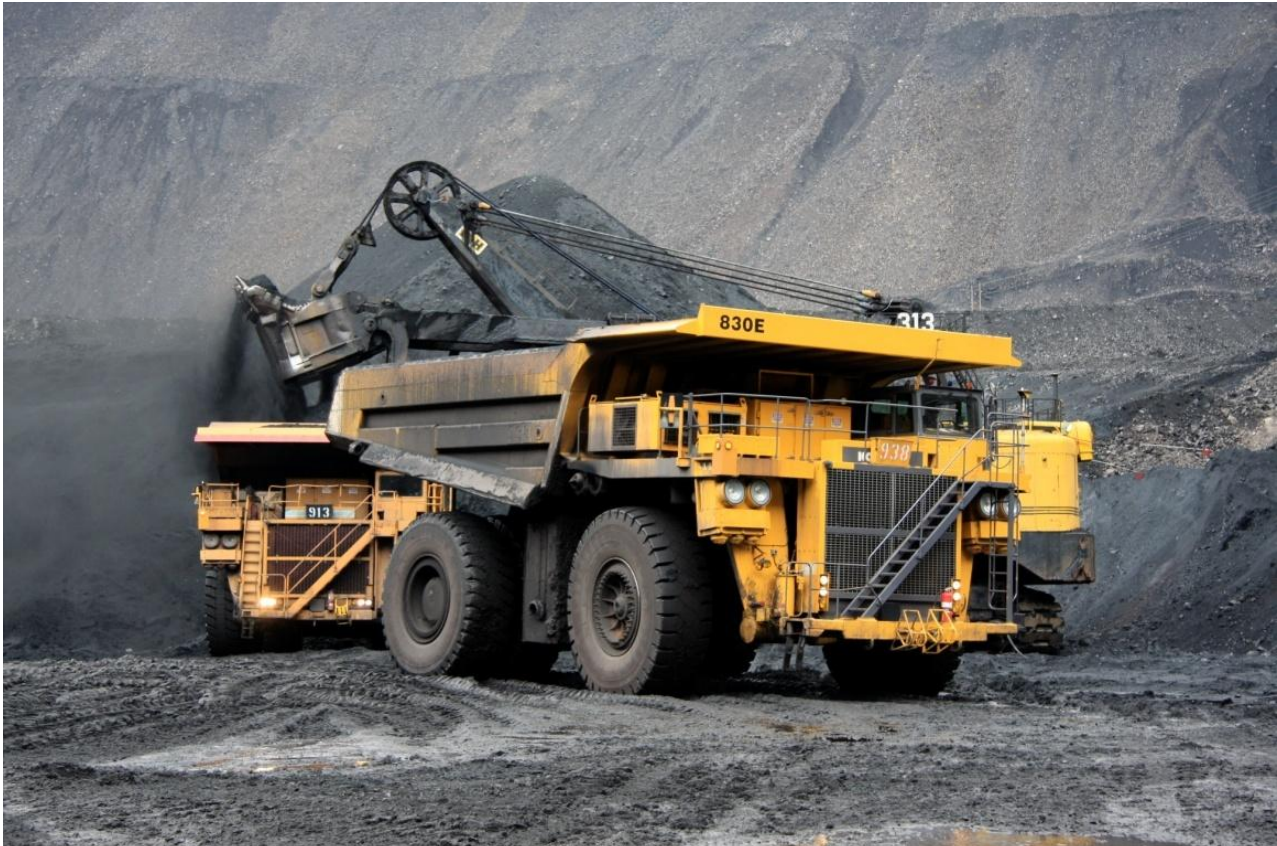
Coal mine site at Elkview, B.C.

sustainability. Projections are tentative, and once the TSM system has been in place for a year, targets will be reviewed and possibly refined.