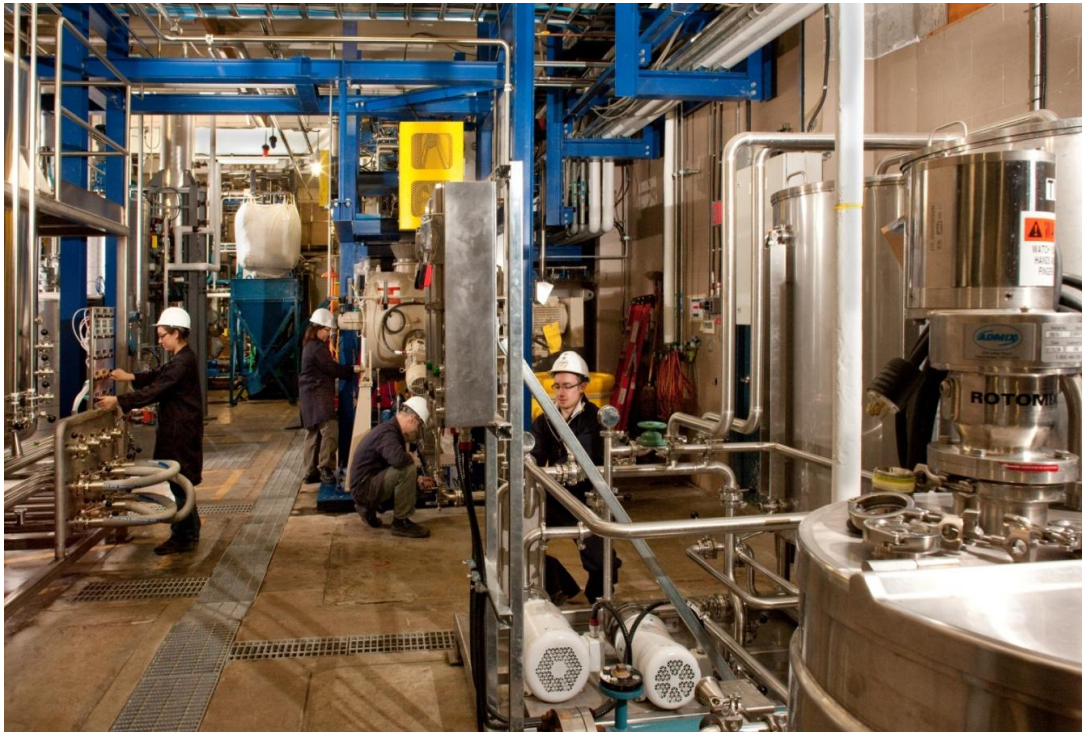
British Columbia based Lignol Energy Corporation is commercializing its patented biorefining technology to produce ethanol and biochemicals from cellulosic biomass. The technology is currently being demonstrated at Lignol’s pilot plant in Burnaby, B.C., which has received financial support from the Innovative Clean Energy Fund.

The LiveSmart BC: Efficiency Incentive Program provides financial support to households for energy assessments and energy efficiency building retrofits. Tens of thousands of British Columbians have displayed their commitment to home energy efficiency through their participation in the program. This performance measure forecasts the average percentage energy savings for program participants resulting from energy efficiency upgrades to their homes. Program participants have their homes assessed by federally-certified energy advisors both before and after efficiency upgrades are undertaken. Examples of eligible home improvements include space heating, water heating and wall and attic insulation.