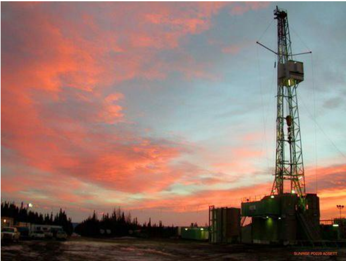
Natural gas drilling rig in northeast British Columbia